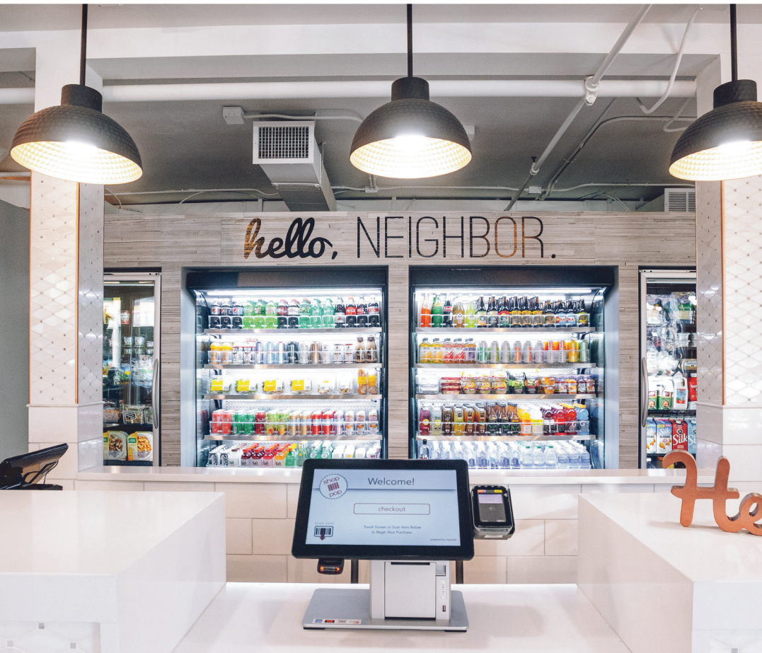
Platte Street Mercantile at Commons West

Assortments are customized to your residents' needs taking a variety of aspects into consideration: